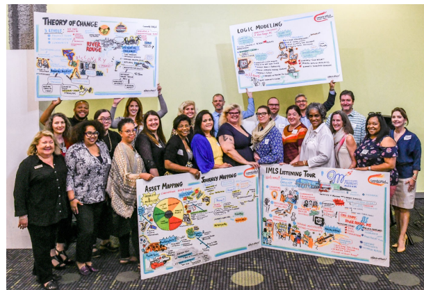
Participants hold up story boards from the Community Catalyst Listening Session in Jackson, MS, 9/13/2019